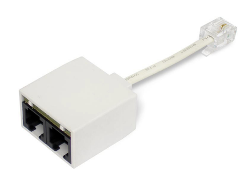
The in-line DSL nanoFILTER